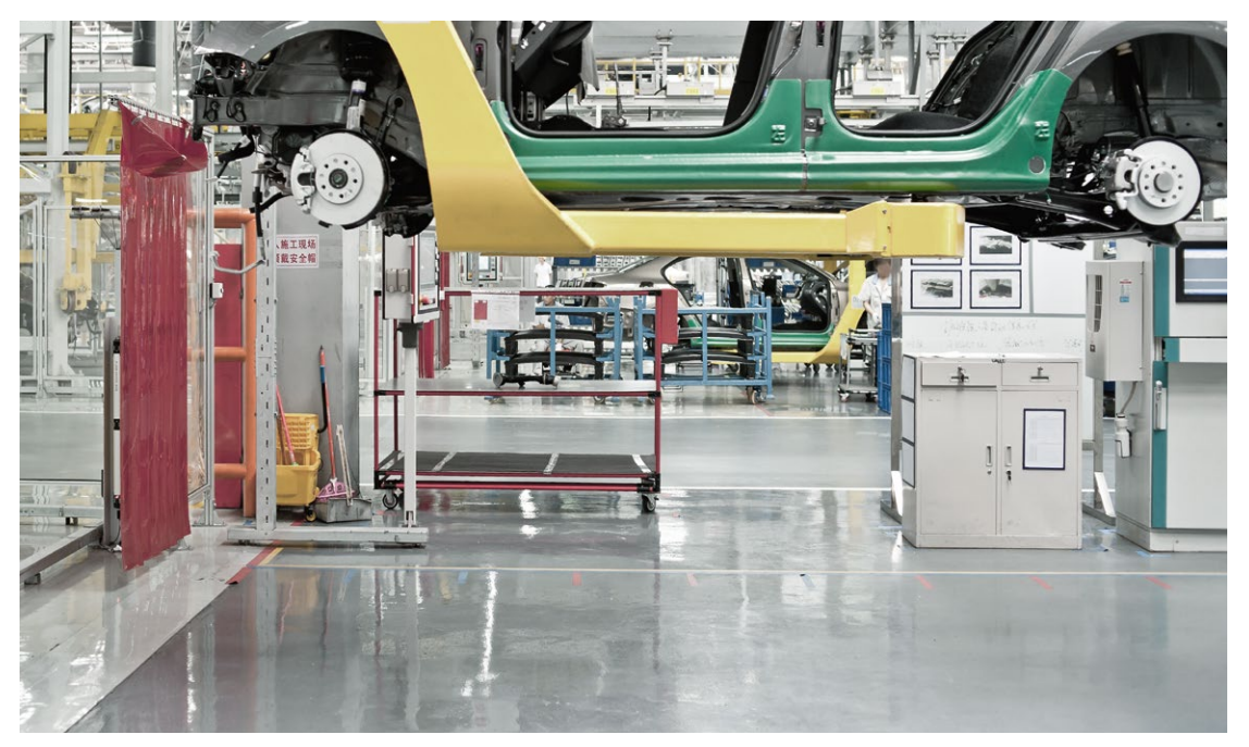
Beruclean 3050 is very good for the residue-free cleaning and care of sealed and coated floors

For coolant changes, new fillings and maintenance of your installations, BECHEM offers various system cleaners. Benefit from the expertise and extensive technical service of the BECHEM application engineers who will be pleased to provide professional advice with regard to your production