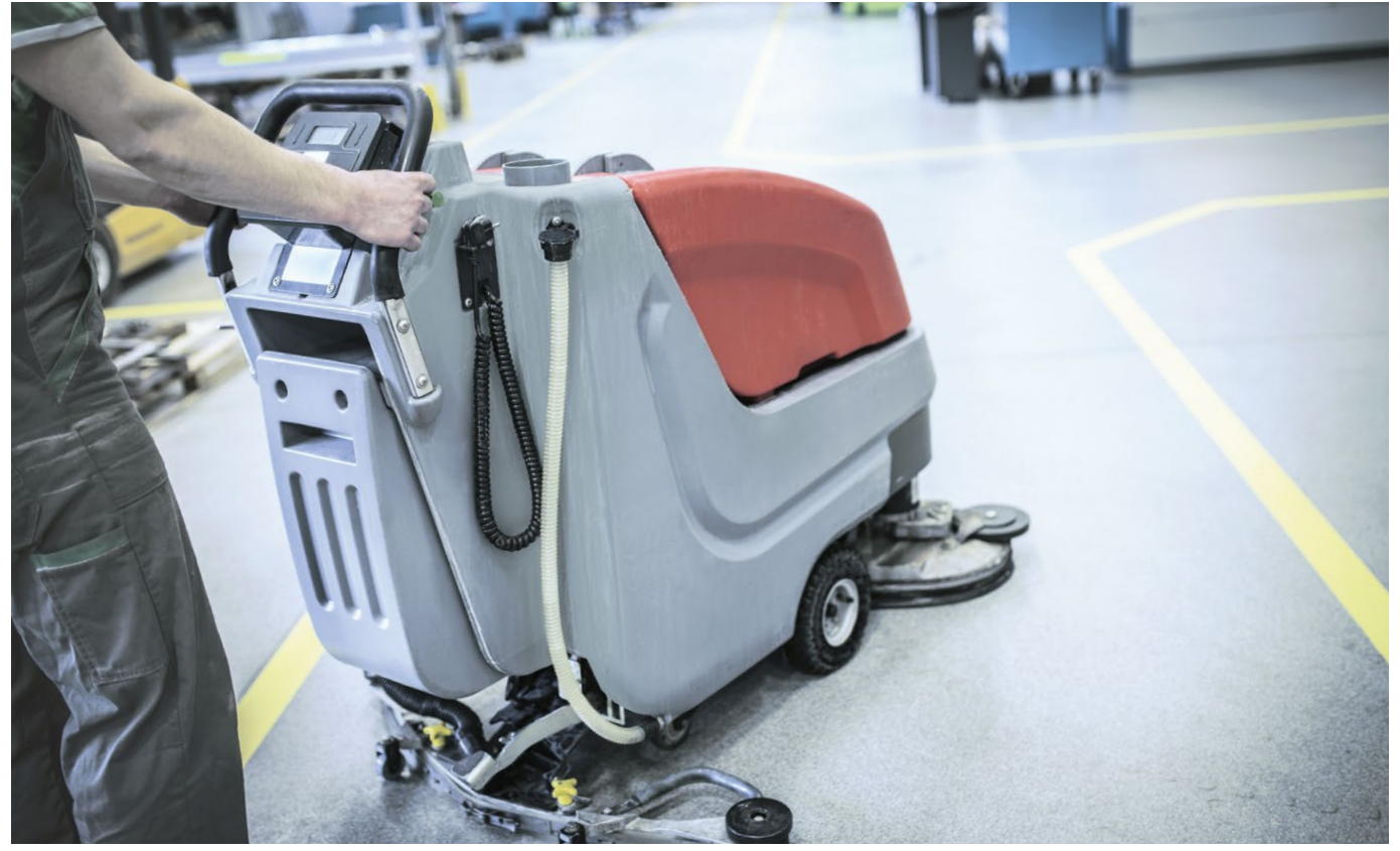
Beruclean 3050 ECO - for the cleaning of industrial floors, machines and vehicles

BECHEM also offers a product range of high-performance machine and floor cleaning agents, besides the such as oils, fats, waxes or tars while going easy on the complete range of fully matched process fluids, industrial cleaning agents and corrosion protection agents for the aluminum, cast iron or steel surfaces. metals-processing industry.